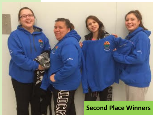
Second Place Winners