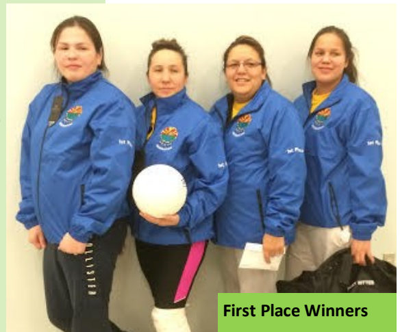
First Place Winners