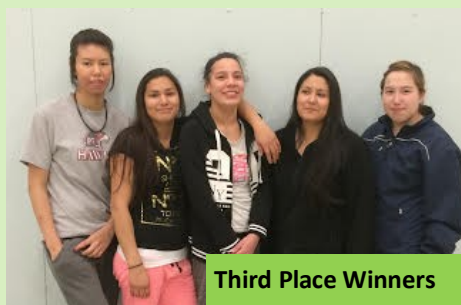
Third Place Winners