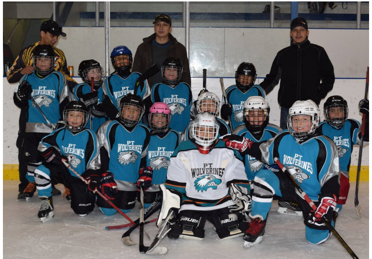
Senior Novice, won Silver