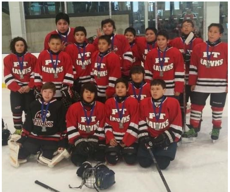
Pee-wee Boys, won Silver