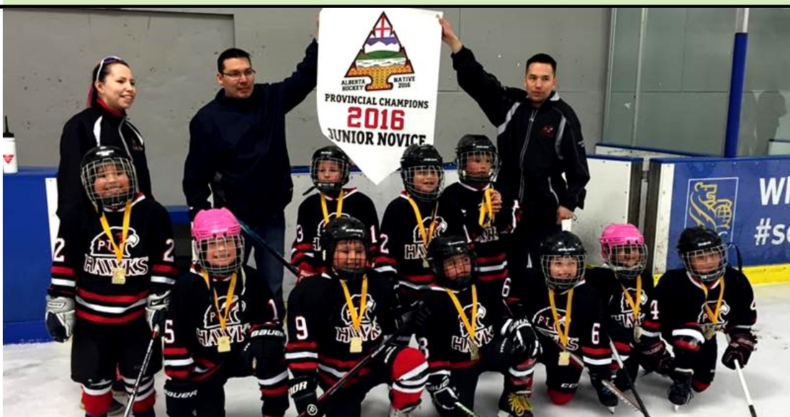
PTFN's Junior Novice Team, brought home the gold!