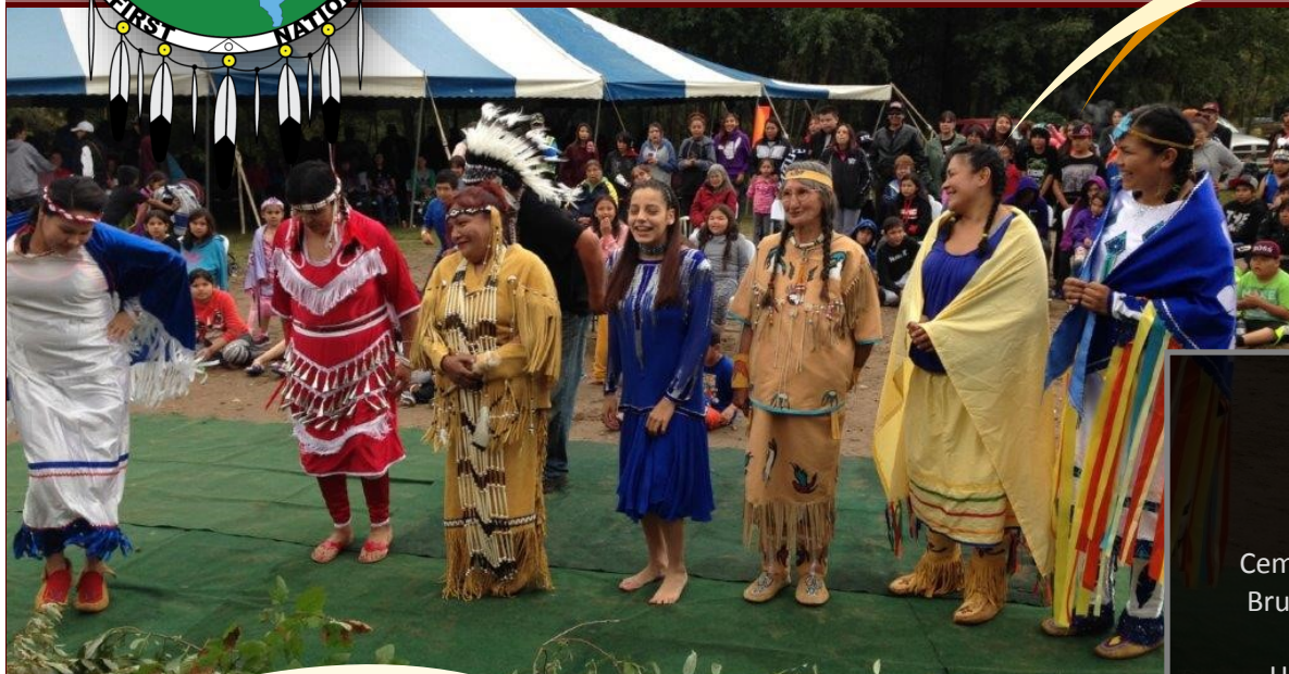
Treaty Day Celebrations –PTFN 2016