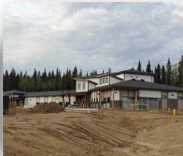
The Health Centre during construction